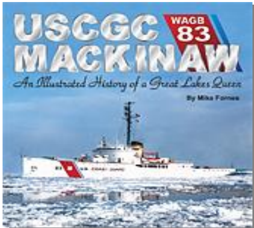
The Original Mackinaw (WAGB-83)